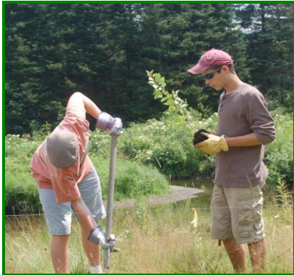
"We planted 120 trees to save the river bank. Protecting the environment means we will have great places to fish."