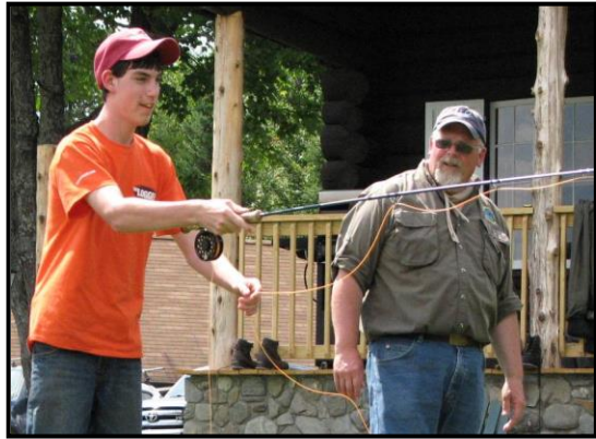
"The instructors made casting fun. They share tips that are easy to remember."